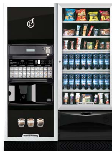
VISTA L + LEI700 PLUS

VISTA L, automatic spiral refrigerated 3° C vending machine for the sale of snacks, confectionary, sandwiches, yogurts and other fresh perishable foodstuffs, cans and bottles available in slave version.