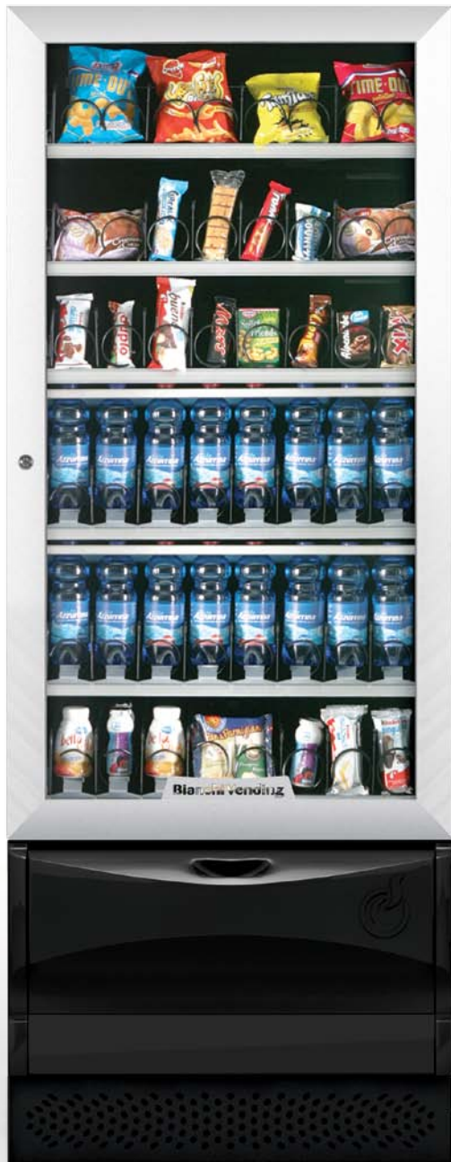
VISTA L SLAVE