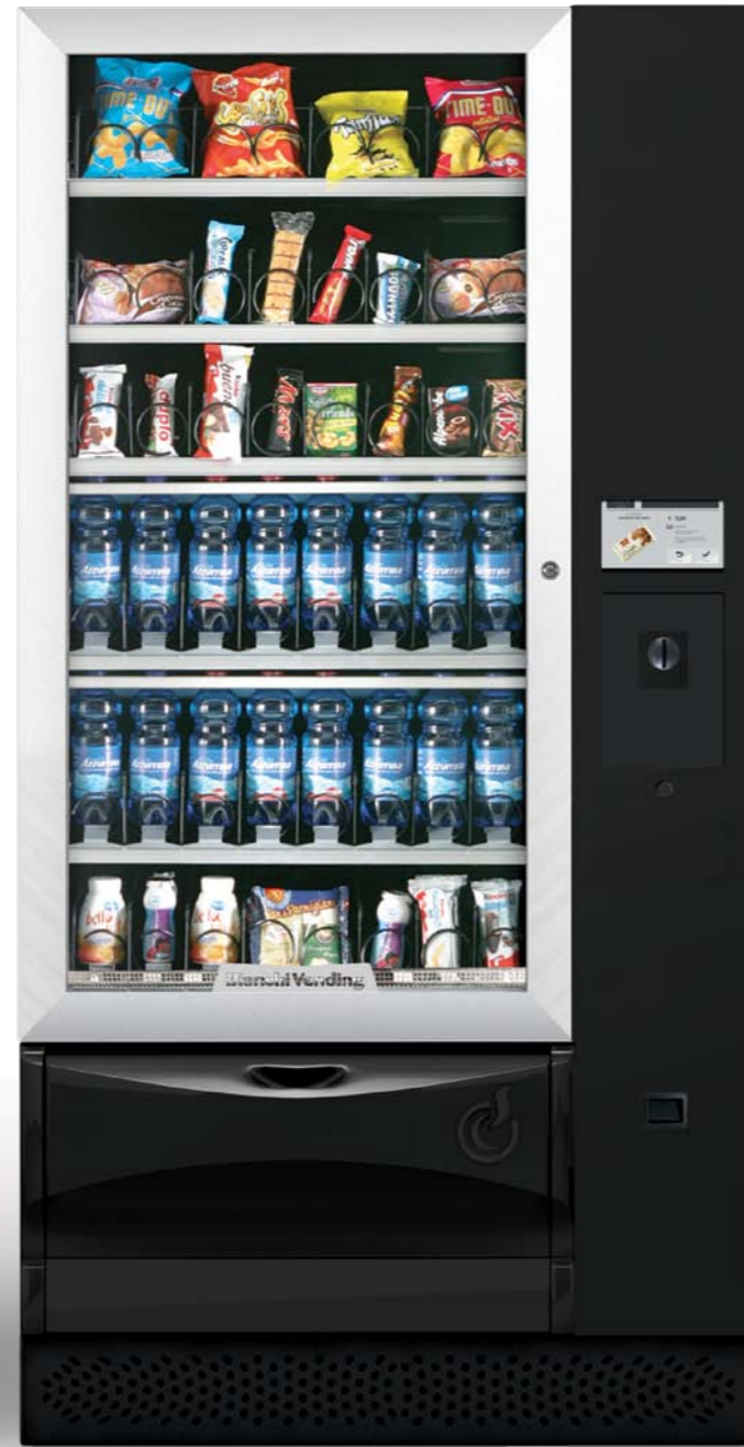
VISTA L MASTER TOUCH 7"