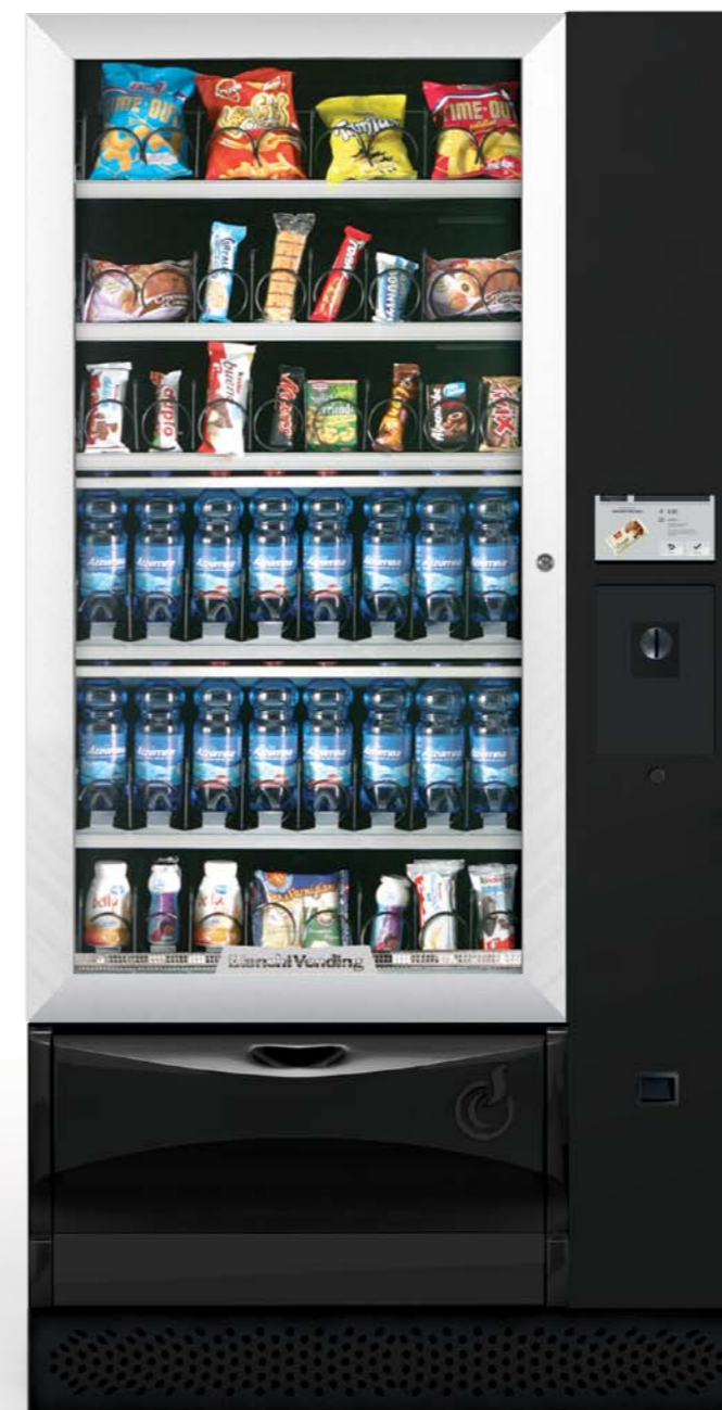
VISTA L MASTER TOUCH 7" WITH LIFT