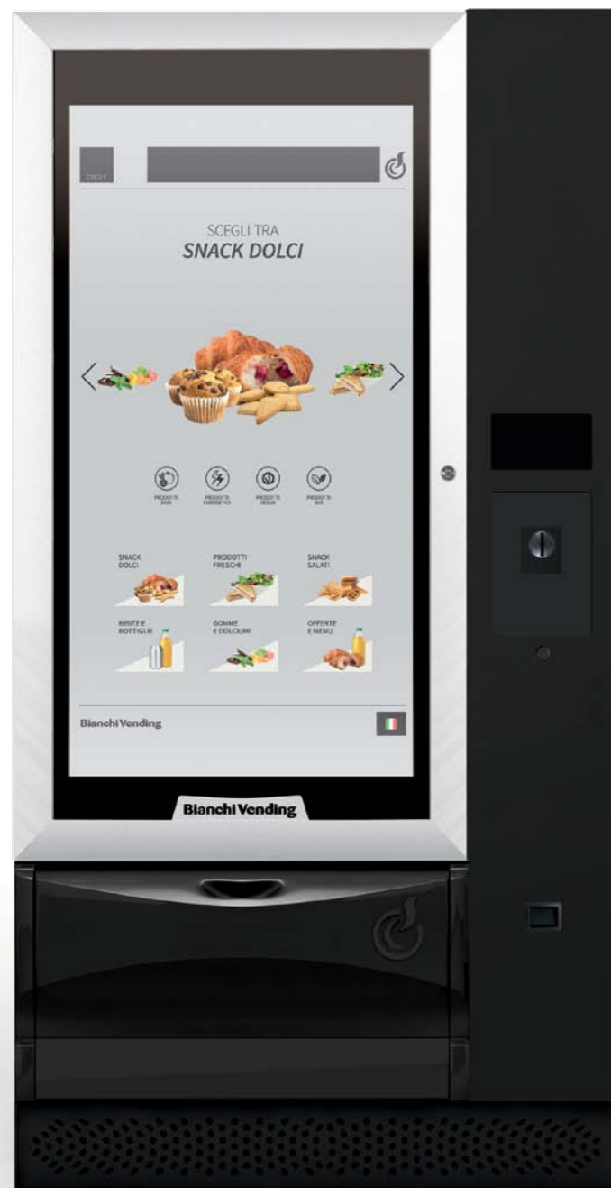
VISTA L MASTER TOUCH 46"

A top range with innovative technologies to provide flexibility and high level of service.