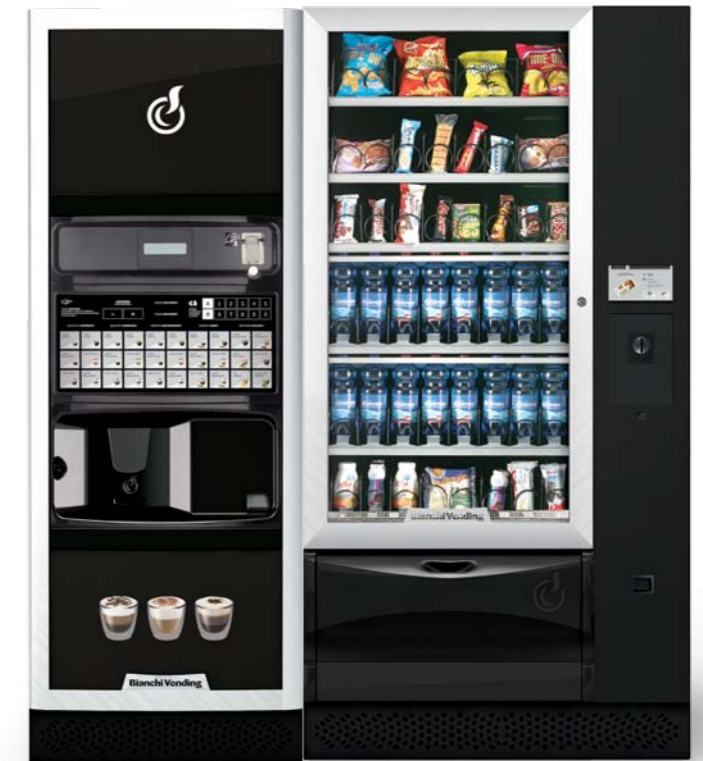
LEI700 PLUS + VISTA L MASTER TOUCH 7"

HIGH QUALITY VIDEO. The LCD technology used in our monitors will accommodate high quality images and promotional or information videos, drawing the user even more powerfully into the consumer experience.