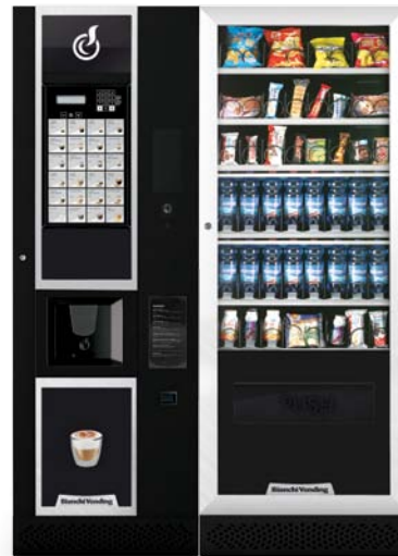
LEI600 SMART + ARIA L SLAVE