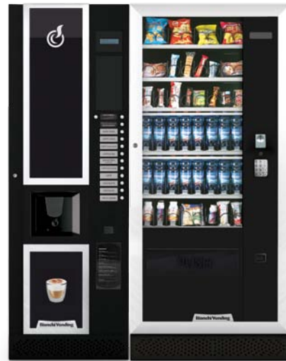
LEI600 + ARIA L MASTER

LEI600, automatic vending machine for hot drinks with 600 cups capacity.