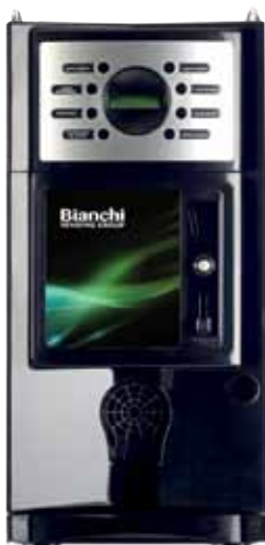
GAIA WITH COIN INTRODUCTION KIT